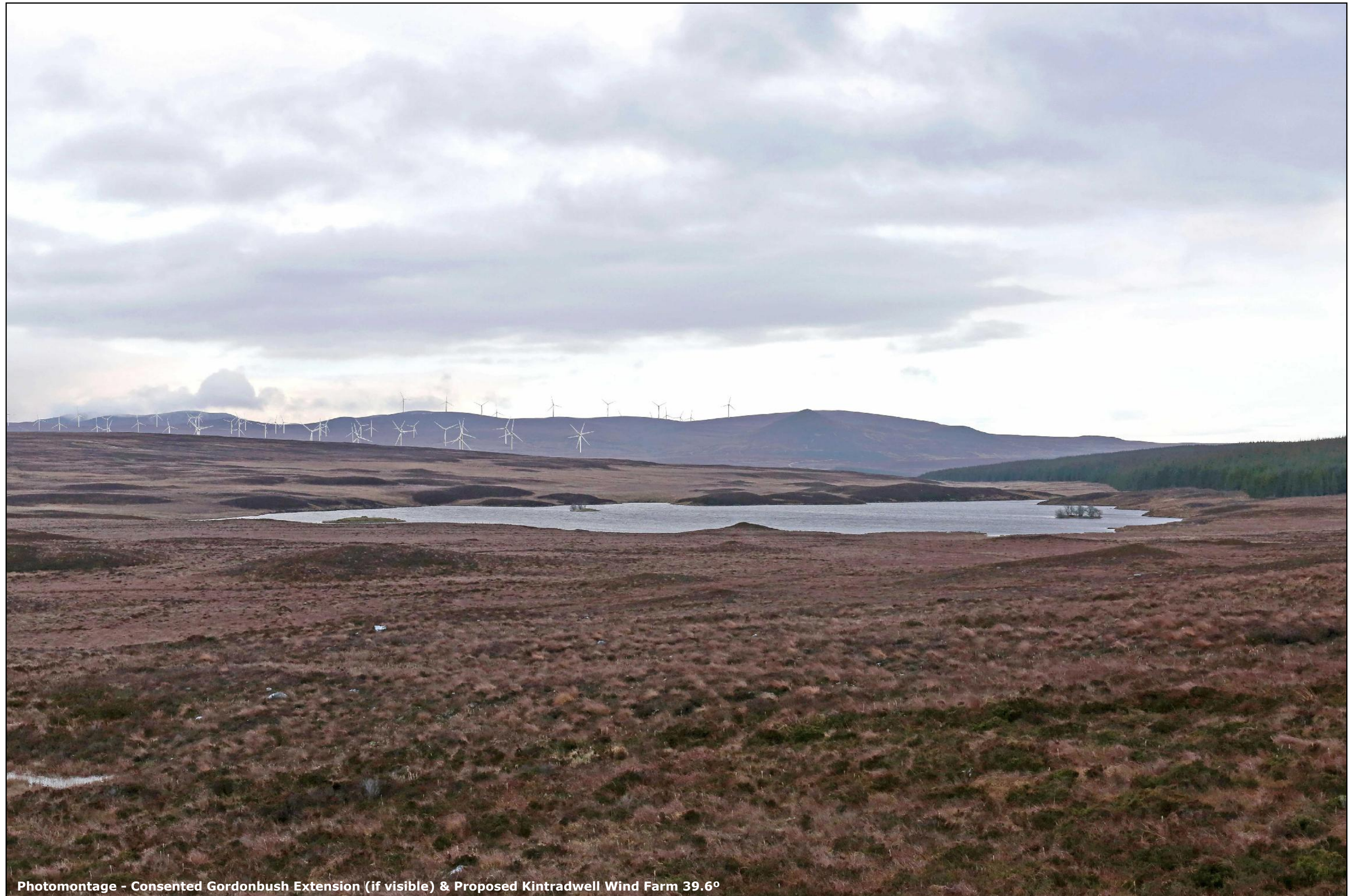
Photomontage - Consented Gordonbush Extension (if visible) & Proposed Kintradwell Wind Farm 39.6°