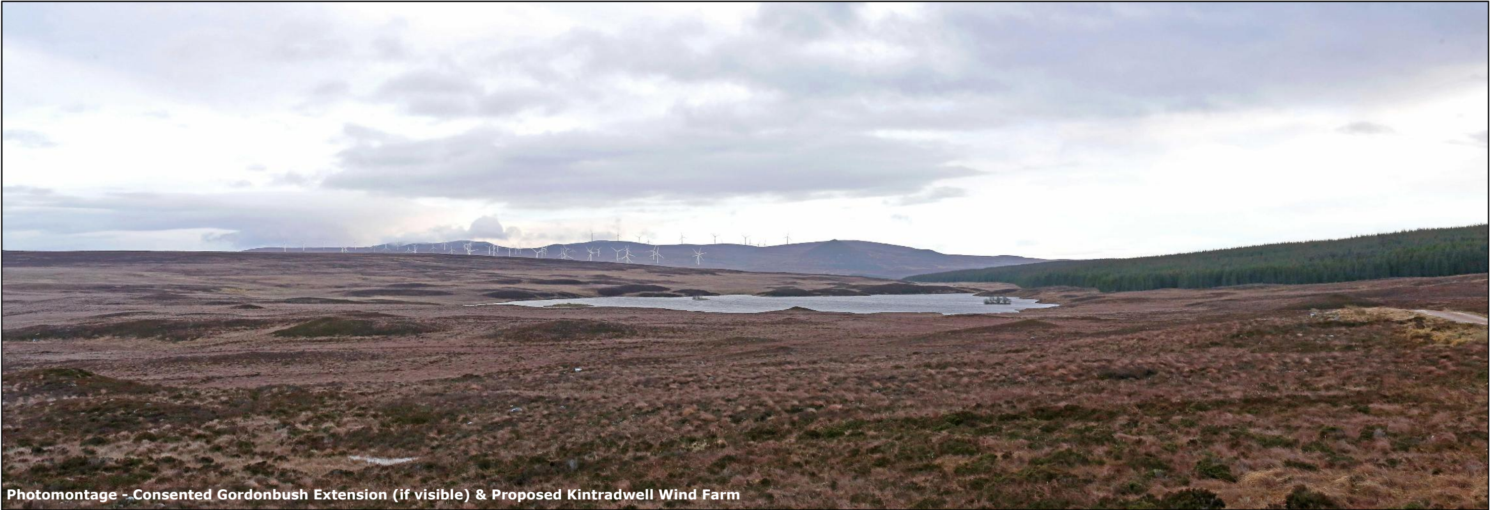
Photomontage - Consented Gordonbush Extension (if visible) & Proposed Kintradwell Wind Farm

Viewpoint 7: Track to Ben Armine Lodge Distance to nearest turbine: 12,916m (T3) Camera: EOS 5D Mark II Focal length: 50mm vertical (27°) x 28mm horizontal (65.5°) Camera height: 1.5m Date: 15/01/20 Time: 15:35