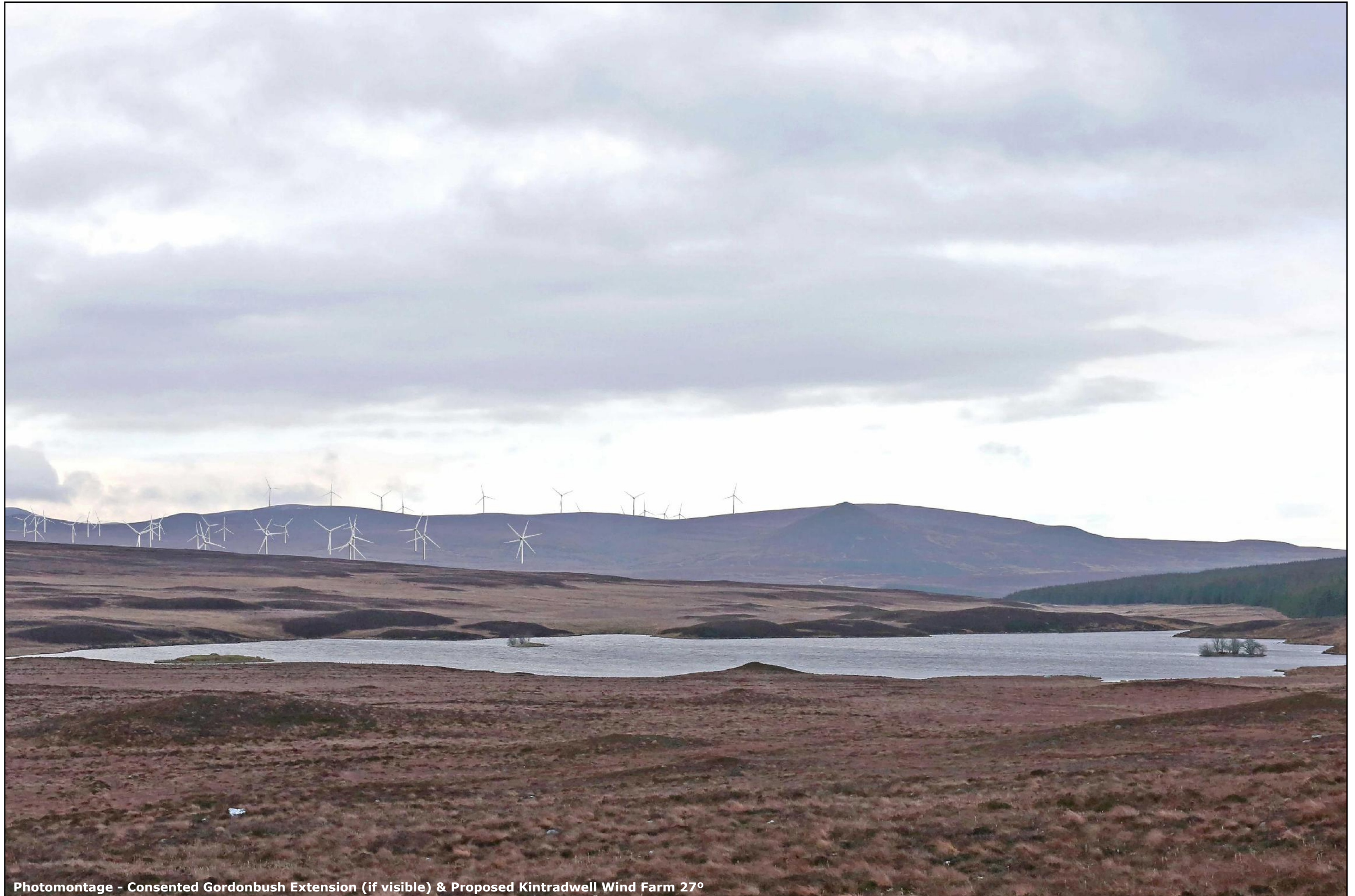
Viewpoint 7: Track to Ben Armine Lodge

Distance to nearest turbine: 12,916m (T3)